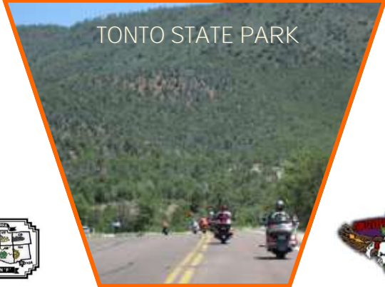
TONGO STATE PARK